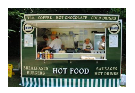
Case Study 4

In 2013/14 the Food Team undertook a considerable amount of food sampling particularly in relation to food fraud and authenticity of meat. This was following the Horse Meat scandal. A number of lamb samples were taken from takeaway premises to check if they were actually lamb. All samples came back as lamb.